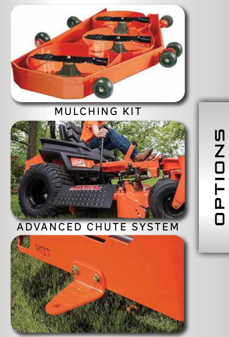
BOLT ON HITCH