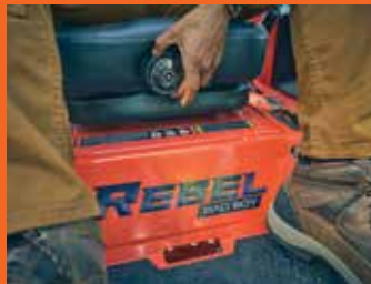
PERFORMANCE THAT ADJUSTS TO YOU

The Rebel comes loaded with premium features for a better mowing experience. You'll get our adjustable suspension seat, run-flat tyres, speed tracking, and adjustable handles at no additional cost.