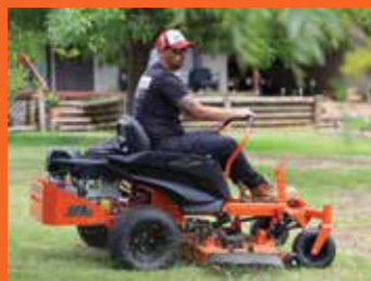
TAKE A SEAT

Most mowers in this price range use flimsy, bolted steel. The MZ Magnum, however, is built with the same professional quality as our commercial mowers.