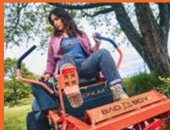
GET DIALED IN

We never compromise on comfort. The cushioned seat adjusts front to back, and the steering is tighter and smoother with our steering dampening system for better response and maneuverability.