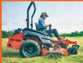
SETTING THE STANDARD FOR FEATURES

Featuring Bad Boy's signature power at a price designed for homeowners. Choose between two powerful engines and two heavy duty deck sizes to give your yard a professional quality cut every time.