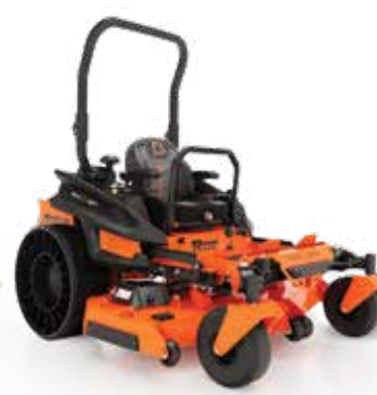
ROGUE REAR DISCHARGE