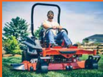
BRING COMMERCIAL GRADE POWER HOME

Featuring Bad Boy's signature power at a price designed for homeowners. Choose between two powerful engines and two heavy duty deck sizes to give your yard a professional quality cut every time.